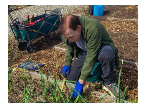
Page 6 photos provided by Kathryn Fitzpatrick Top right column photo by Jacob DiPonio All other Page 7 photos by Lynette Leroux