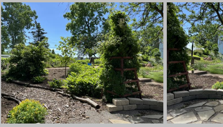
Views from the new Patio!